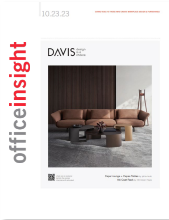
Cover | 6 7/8 x 8 1/2 (officeinsight only)