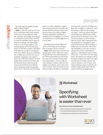
Half Page | 6 7/8 x 4 1/4